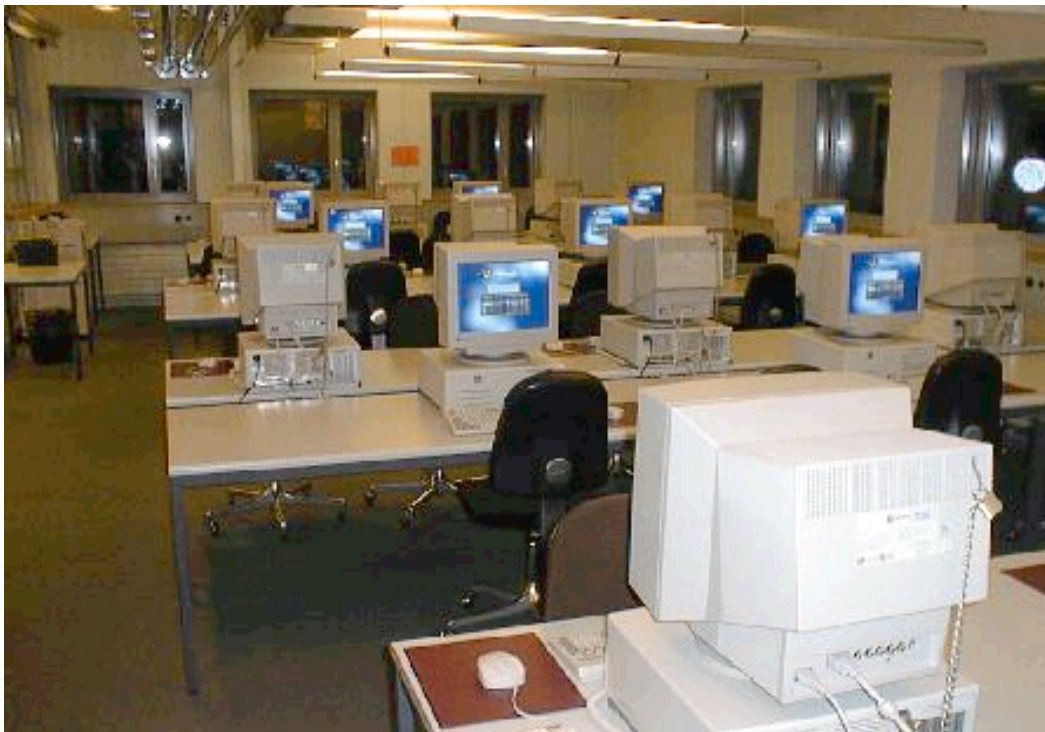
Figure 1: The Patagonia cluster.

In this white paper we report about the use of System Commander to configure and operate such clusters as well as about a few interesting technological problems we solved to make our Patagonia cluster at the Swiss Institute of Technology, ETH Zürich (see Figure 1) a viable research vehicle in all three mentioned areas of cluster computing. We indicate that it is impossible to accommodate all needs with a single operating system installation and demonstrate that flexibility can be achieved with a multi-boot setup, featuring multiple independent operating system installation on a single computer. The OSES include our own ETH Oberon System, Microsoft Windows NT and Linux.